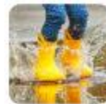
Puddles and Rainbows