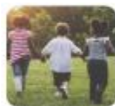
Me and My Community